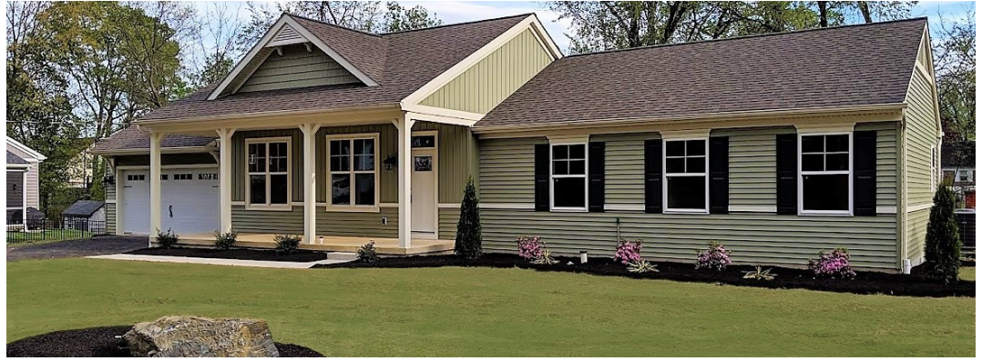
Lawn in photo is modified - seeding just completed